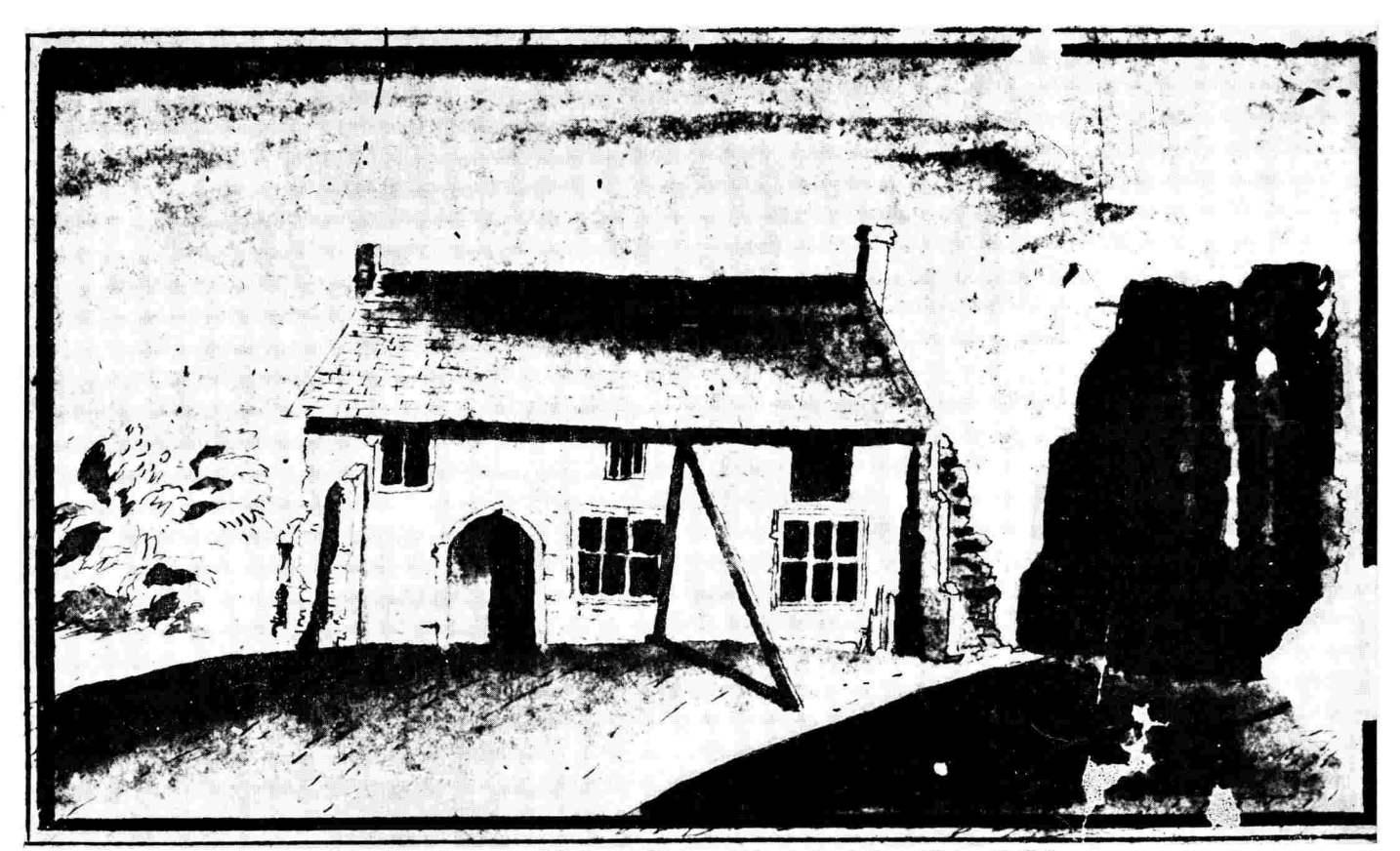
'The West Prospect of Ruins of Walton Abbey', by Joshua Kirby.